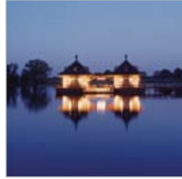
Marina, with Courtesy Access to Kayaks, Canoes and Fishing Boats