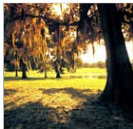
Preserved Shade Trees Throughout