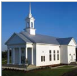
Chapel Hill Meeting House