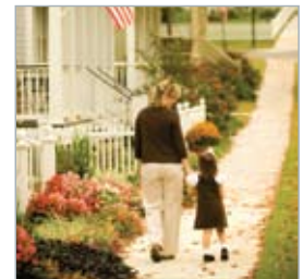
Extra Wide Sidewalks