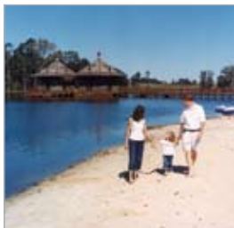
Lake Cameron Beach