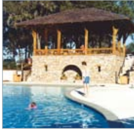
Pool, Pool House and Community Pavilion

Here at The Waters, you'll find the region's finest amenities ready and waiting.