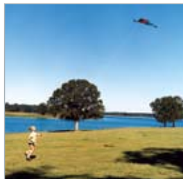
Acres and Acres of Parkland