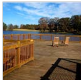
Lake View Piers