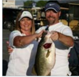
World Class Fishing on Lake Cameron