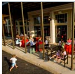
The Blue Heron Cafe