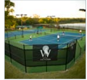
Five Lighted Tennis Courts, Pro Shop, plus Basketball Court